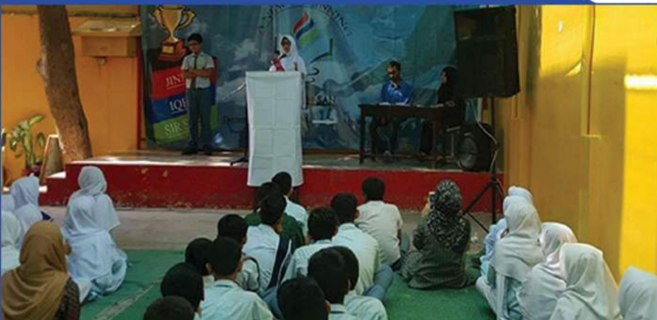
As part of the SET Alumni Network initiative, a Declamation Contest was organized by Alumni for the SET School students in October.