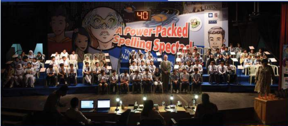
Students participated in the National Spelling Bee Contest held on October by Dawn Media Group.